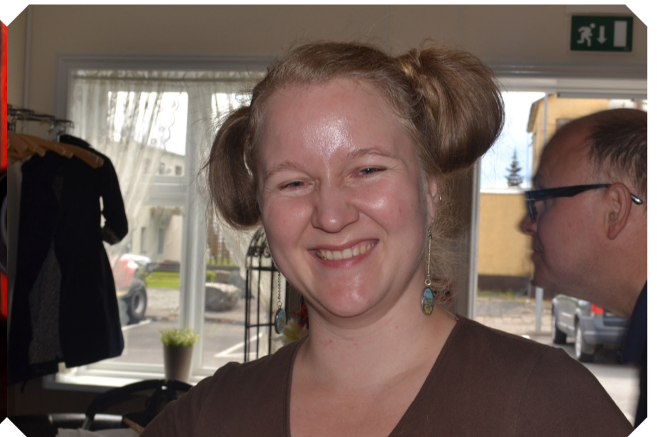
Princess Leia Organa

Look out for some more dopplegangers for the upcoming issues of Krækingur