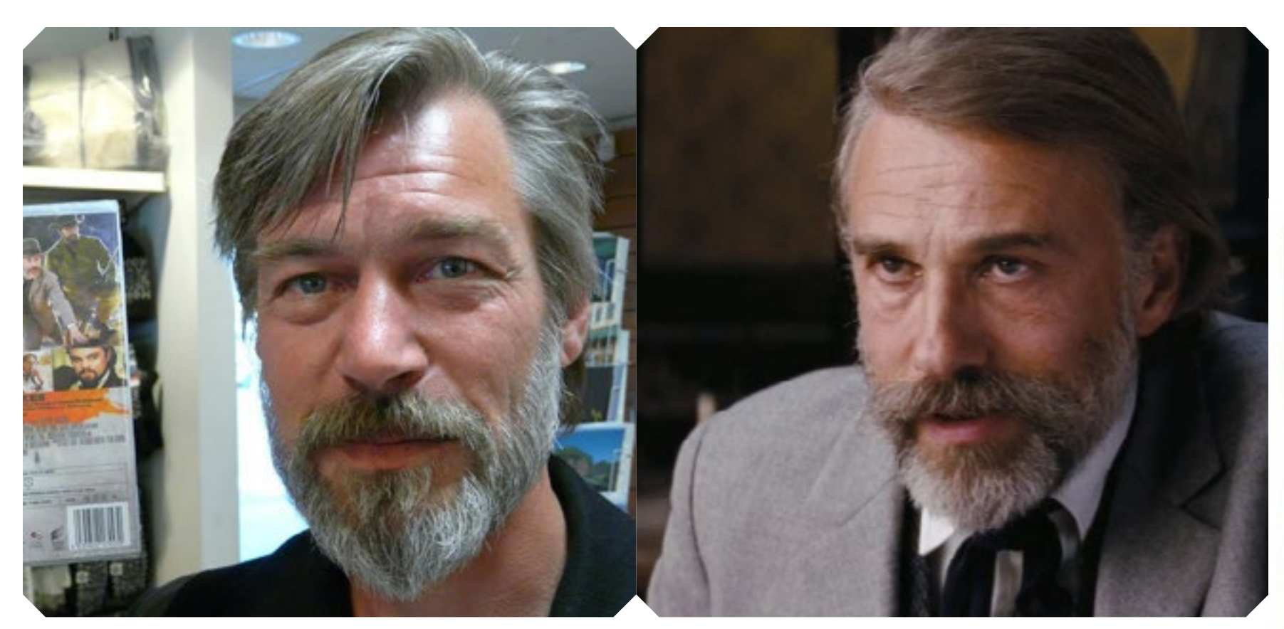
Dr. King Schultz in Django Unchained