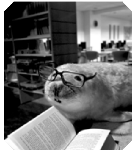
The Seal A seal wearing glasses