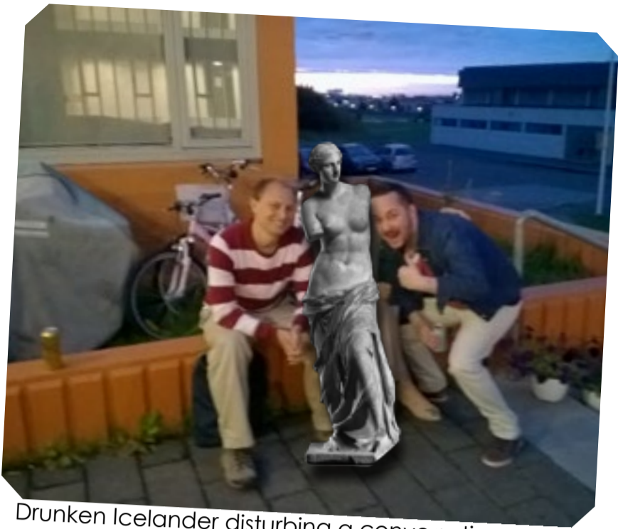
Drunken Icelander disturbing a conversation about art history.