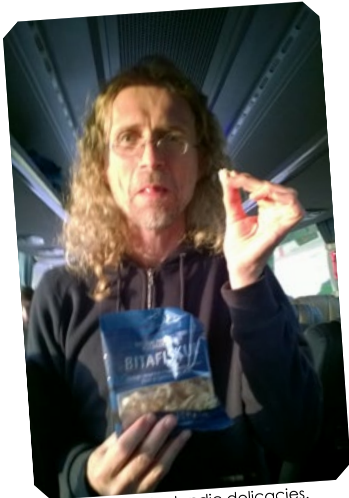
Per sampling Icelandic delicacies.