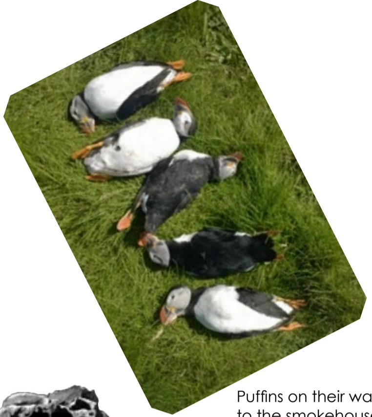
Puffins on their way to the smokehouse.